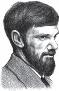
D.H. Lawrence 1885-1930

D.H. Lawrence was born in a coal-mining town. He was the son of an uneducated miner and an ambitious mother who was a teacher. His wife was German, and the couple lived, at various times, in Italy, Germany, Australia, Tahiti and Mexico. Lawrence's writings reflect a revolt against puritanism, mediocrity and the dehumanisation of an industrial society.